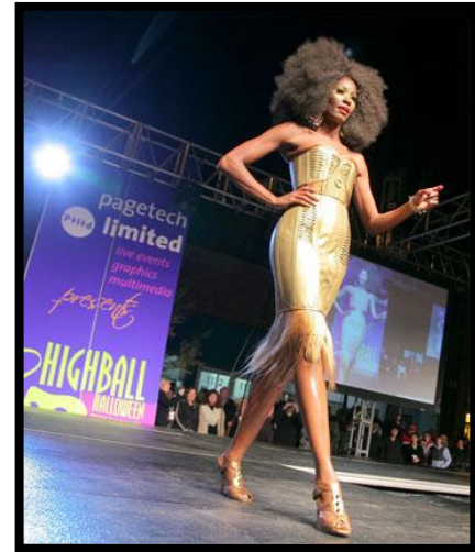
Fashion Look by Wild Hunt Corsetry

What: 2011 HighBall Halloween: Masquerade On High presented by pagetech limited When: Friday · October 28, 2011 5:00PM - 1:00AM Where: On High Street at the intersection of Fifth and High in the Short North Arts District Why: A celebration of the fabulous side of Halloween... the art of design and the masquerade Signature: A dazzling 60-foot runway built outdoors under the iconic Short North arches Attendance: 20,000 Online: HighBallHalloween.com Media Contact: John Angelo, HighBall Producer John@DestMar.com Admission: General admission - $5 at the gate VIP package - $65 advance purchase includes private bar, backstage pass, and preferred runway/stage seating Entertainment: DJs · Dancers · Stage Performances · Theatrical Numbers Giant Body Puppets · Light Shows · Real-Time UV Mural Painting Contests: Dogtober Howl-o-ween Canine Costume Contest Costume Couture Fashion Showdown Professional designers' competition HighBall Costume Contes General Public - Five competition categories: