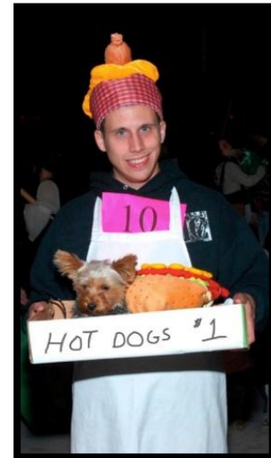
Dogtober Howl-o-ween kicks off the HighBall celebration

What: 2011 HighBall Halloween: Masquerade On High presented by pagetech limited When: Friday · October 28, 2011 5:00PM - 1:00AM Where: On High Street at the intersection of Fifth and High in the Short North Arts District Why: A celebration of the fabulous side of Halloween... the art of design and the masquerade Signature: A dazzling 60-foot runway built outdoors under the iconic Short North arches Attendance: 20,000 Online: HighBallHalloween.com Media Contact: John Angelo, HighBall Producer John@DestMar.com Admission: General admission - $5 at the gate VIP package - $65 advance purchase includes private bar, backstage pass, and preferred runway/stage seating Entertainment: DJs · Dancers · Stage Performances · Theatrical Numbers Giant Body Puppets · Light Shows · Real-Time UV Mural Painting Contests: Dogtober Howl-o-ween Canine Costume Contest Costume Couture Fashion Showdown Professional designers' competition HighBall Costume Contes General Public - Five competition categories: